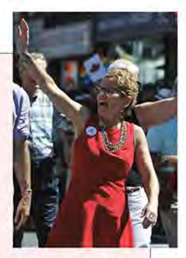
same-sex partners, with all the rights and benefits other married couples enjoyed.