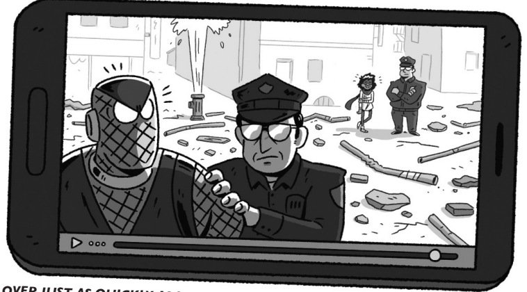
OVER JUST AS QUICKLY AS IT STARTED, THE BATTLE LEFT NEWARK AVENUE A LITTLE WORSE FOR WEAR. BUT THANKFULLY, OUR NEW HERO GOT THE SHOCKER BACK WHERE HE BELONGS! BEHIND BARS!