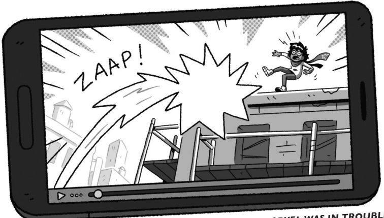
JERSEY CITY'S MYSTERIOUS NEW SUPER HERO MS. MARVEL WAS IN TROUBLE EARLIER THIS EVENING. AFTER FACING OFF WITH AND DEFEATING THE TINKERER, MS. MARVEL WAS SHOCKED...