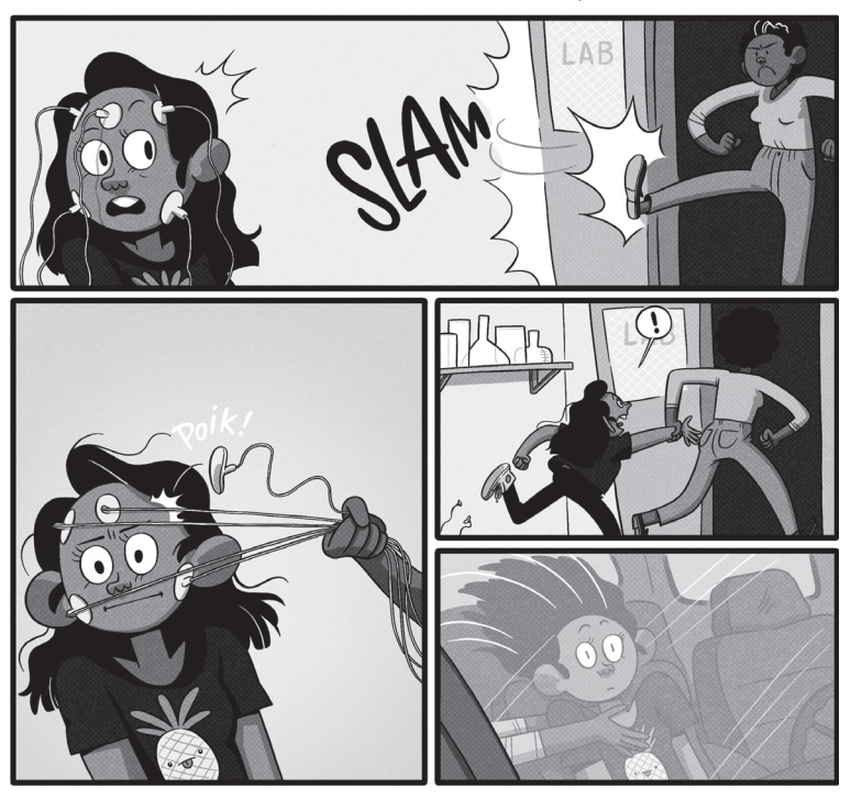
"Non-stop? That's a heck of a drive!"

spooky-cool. "And then I can hear Fassbinder and my mom talking in the waiting room. Then they're yelling. Then the door opens, Mom busts in all crazy eyes, grabs me, tears off all the wire-stickies — which, ouch! — hauls me out of the institute, throws me into the car, and drives like a maniac back to Dimly. Like, non-stop."