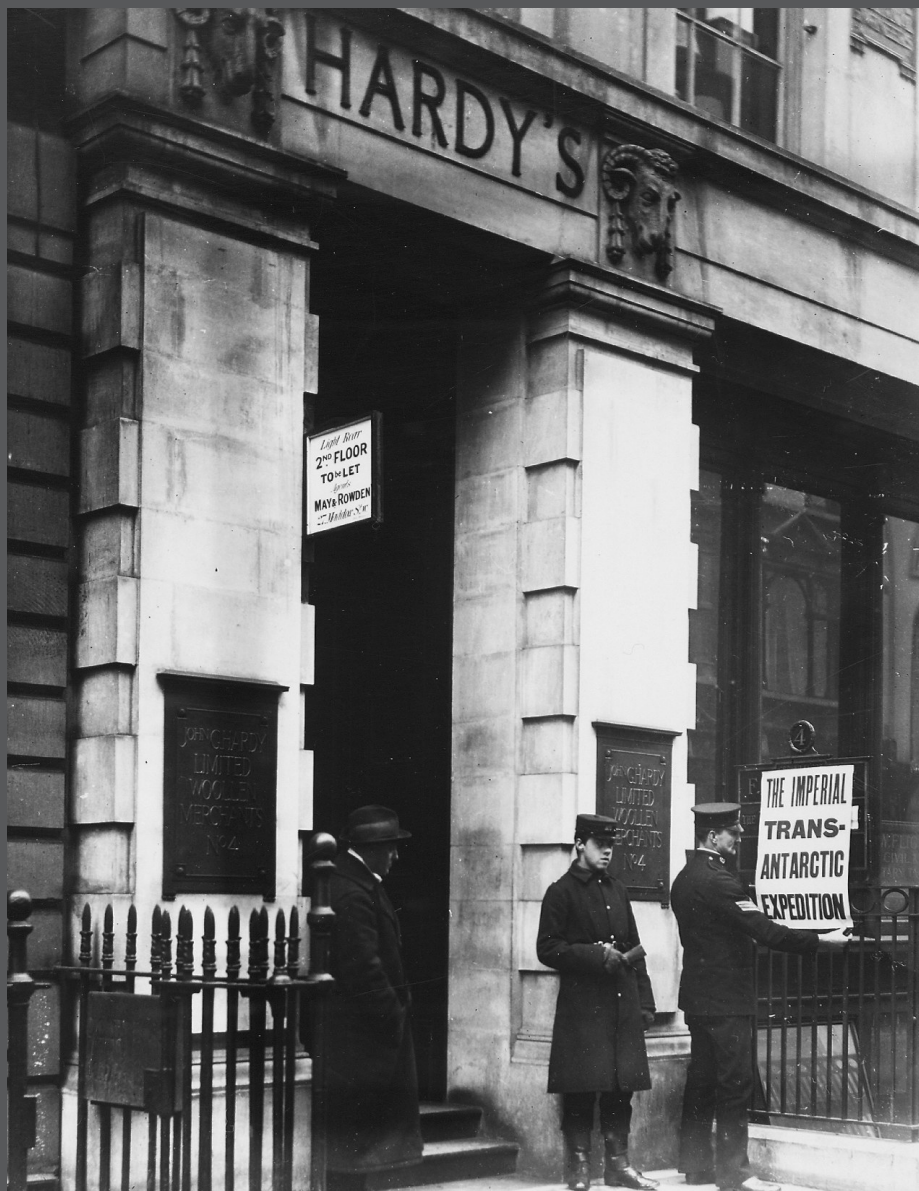
The offices of the Imperial Trans-Antarctic Expedition, open for business.