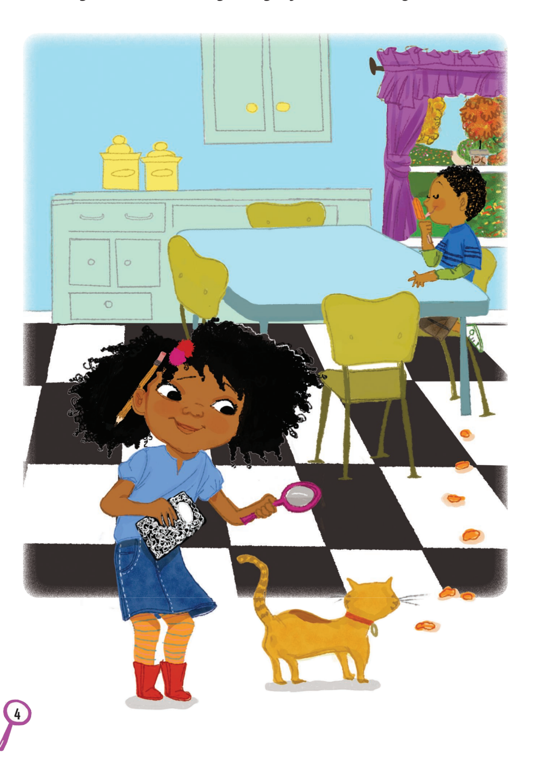
They solved the mystery of the missing snack.