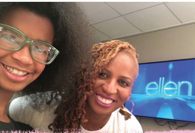
Me and Mom at The Ellen DeGeneres Show.