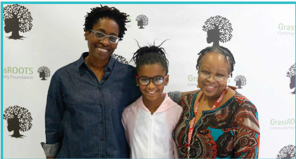
Bestselling authors Jacqueline Woodson (left), me, and Rita Williams-Garcia.

So my mom and I were snug in a booth at a diner one Thursday after school. Or maybe it was a Tuesday. And I was eating pancakes, all good. It was November, almost the holidays. We were talking, just about stuff: the year that was coming to an end, the year that was about to begin. My mom, who is brilliant and the coolest and completely crazy—I'm not being a brat, anyone in my family would say the same,